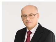
Prof. Zdzisław Krasnodębski Member of the European Parliament